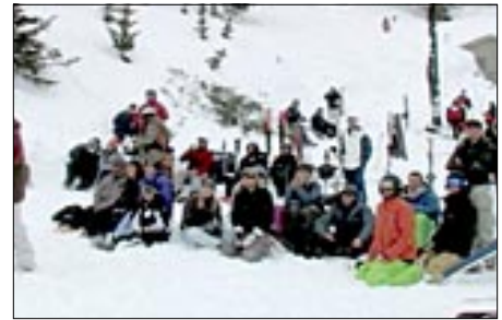
Watching Saturdays runs from Kachina Peak.