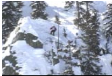
Skier works way through trees and rocks