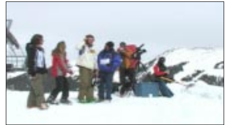
Webcast personnel and participants on snow cover hill at broadcasting point overlooking Kachina Peak bowl.