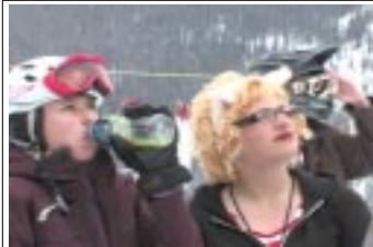
What is happening is all up on Kachina Peak's slopes, well almost all.